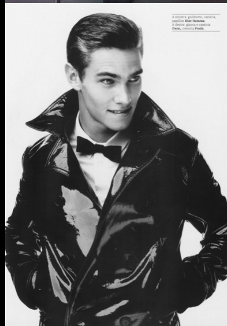
A sinistra: giacchino, camicia, pantaloni Dior Homme. A destra: giacca e camicia Olsen, cravatta Prada.