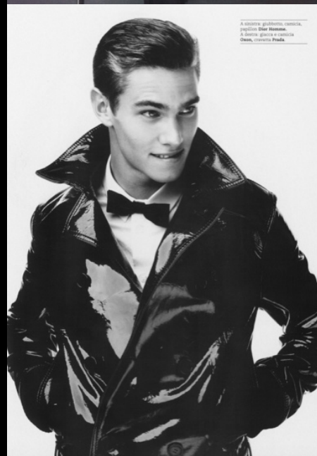
A sinistra: giacchino, camicia, pigiama Dior Homme. A destra: giacca e camicia Olson, cravatta Prada.