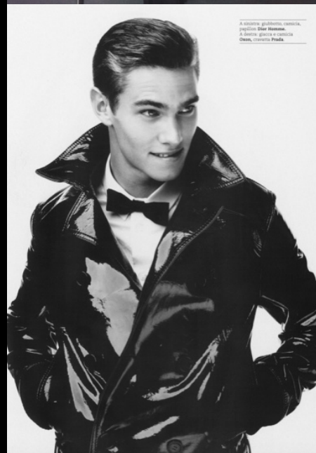
A sinistra: giacchetto, camicia, pigiama Dior Homme. A destra: giacca e camicia Olson, cravatta Prada.