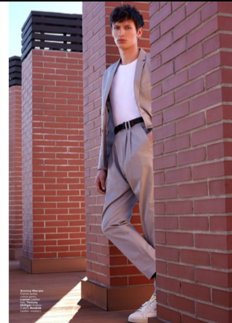
Arnicae Pleats Levine pants Levine jacket Dior Martine Hiltop Backpack Hiltop Leather Hiltop Bag